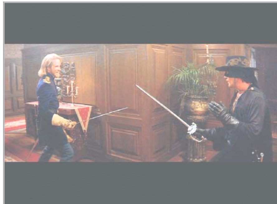
Matt Letscher, left, and Antonio Banderas in "The Mask of Zorro." Columbia Tristar Home Video

Unaltered screen-captures from the two-disc special edition of "The Mask of Zorro" (Columbia Tristar, $27.95) illustrate the two main ways it's handled.